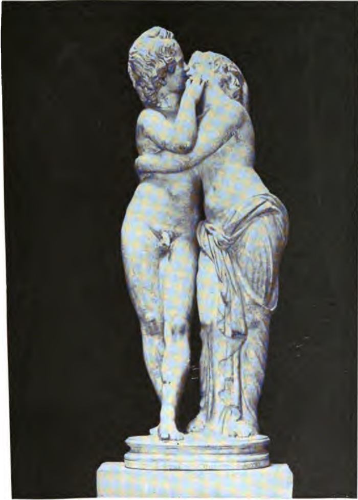
Fig. 35. Cupid and Psyche.